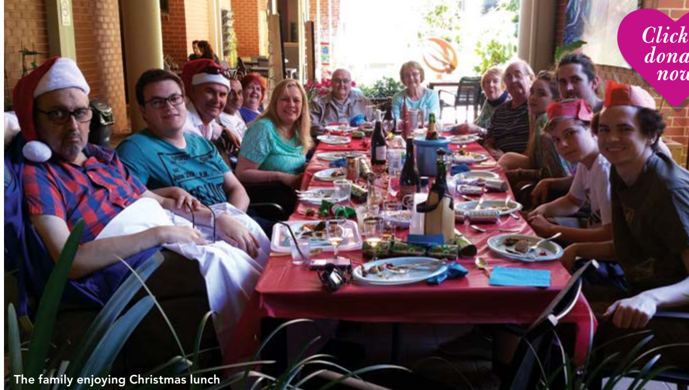
The family enjoying Christmas lunch